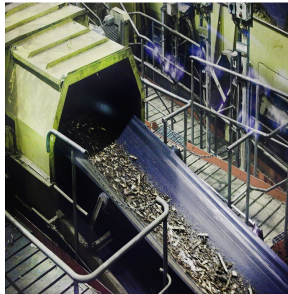
• Bark comes from the barking drum at Rottneros Mill

A decision was made to continue production of groundwood pulp at Rottneros Mill.